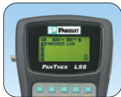
Graphic Display with Backlight